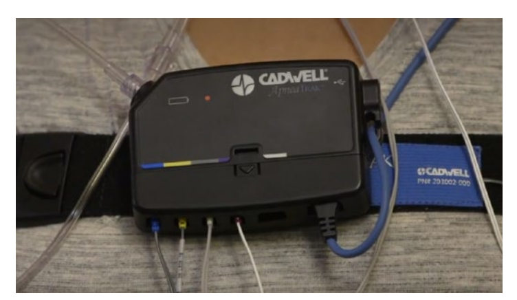
Recessed connections are protected, and elevated from the patient's body to improve comfort and reduce overall size.

The built-in, rechargeable battery records up to three nights on each charge and saves you the cost and headache of dealing with disposable batteries. Non-proprietary connections give you the freedom to choose the accessories you prefer.