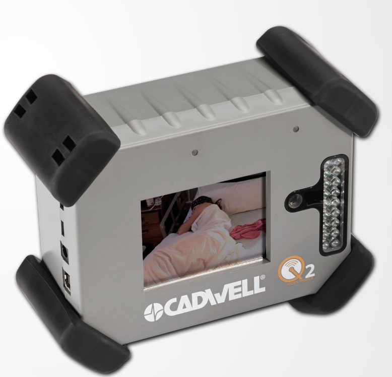
Q-Video Mobile 2 has infrared lights for low-light recording