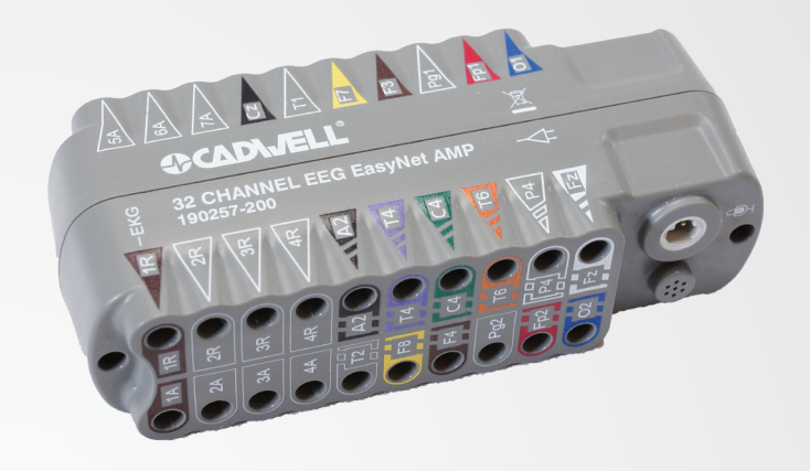
32-channel amplifier is color-coded and comes with a wearable pouch

Add Q-Video Mobile™ 2 with automatic infrared sensors to capture video of your patient's unattended sleep study.