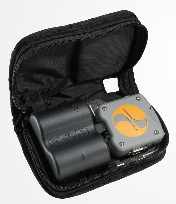
Recorder and battery lets you record up to 48 hours